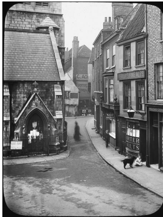
1908 Kings Square