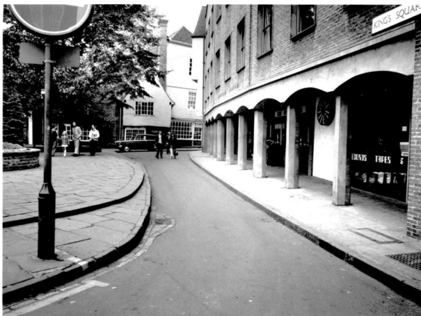
Kings Court circa 1960