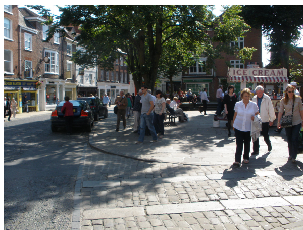
Kings Court 2012